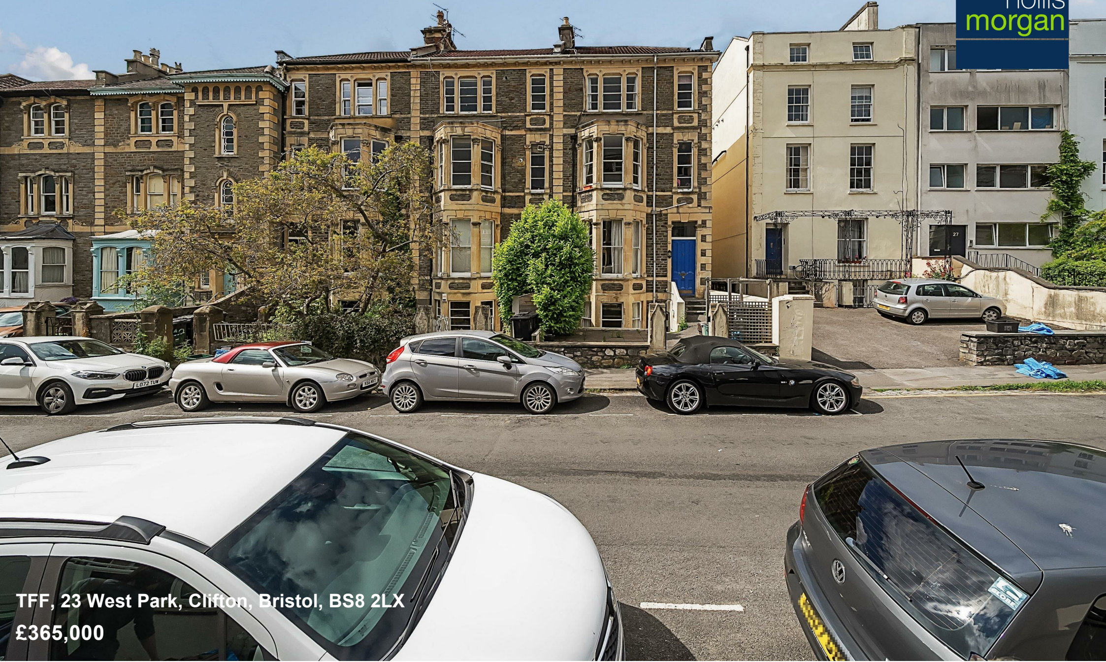
TFF, 23 West Park, Clifton, Bristol, BS8 2LX £365,000